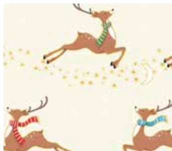
2482/Q Flying Deer