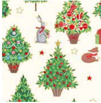
2481/Q Christmas Trees