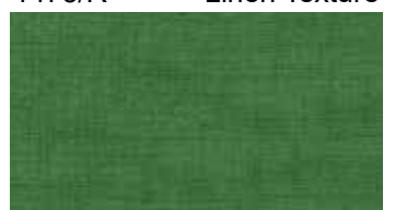
1473/G5 Linen Texture