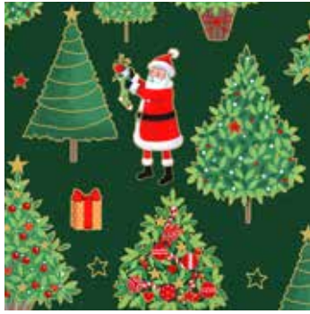
2481/G Christmas Trees