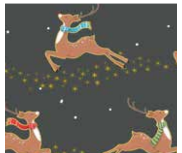
2482/S Flying Deer