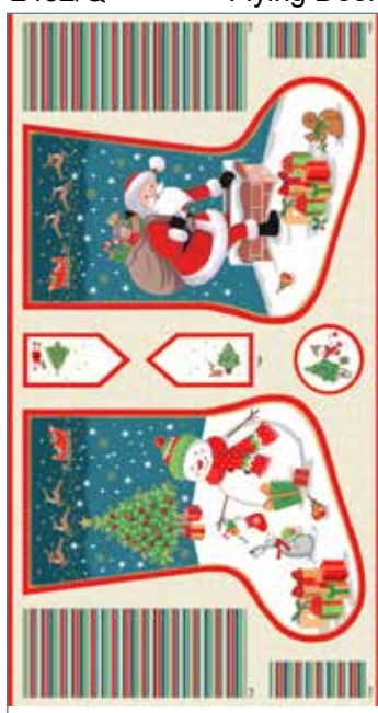
2488/1 Large Stocking