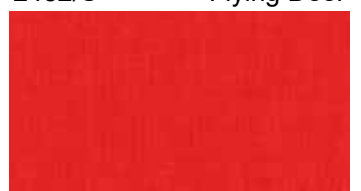
1473/R Linen Texture