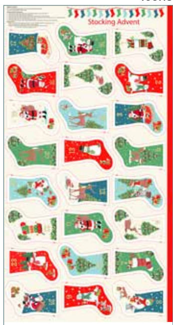
2487/1 Advent Mini Stocking